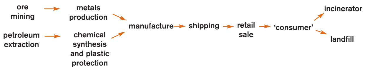
Figure 1.1 Cradle-to-grave electronics life cycle

Edwin Datchefski’s notion offers a similar approach, which is captured very simply in the three words ‘safe, solar, cyclic’. 10 Products should be made from materials that are not toxic; they should only consume renewable energy in manufacture and use; and should be made from materials that are compostable and organic, or continuously cycled.